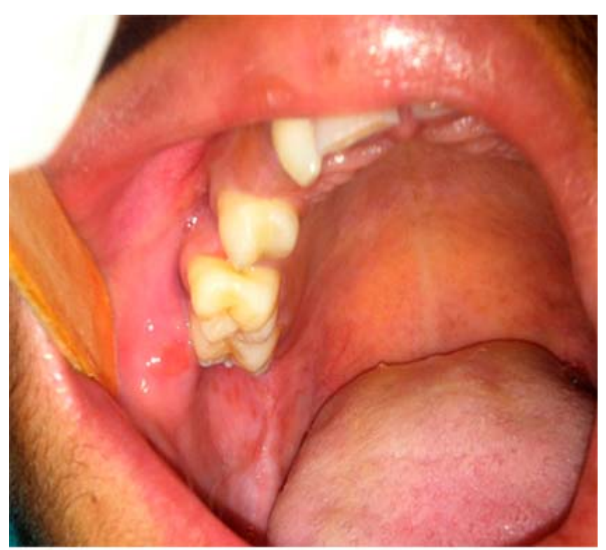
Fig. 3. After a year and a half of monitoring after chemotherapy, an intraoral examination confirmed complete lesion remission.

The oral tumor began to regress after four cycles of chemotherapy ( \underline{\text{Fig. 3}} ). The patient was discharged in good clinical condition and was hemodynamically stable and afebrile. The cholestasis was resolved and the ART was reintroduced. The patient presented with an LT CD4 of 385 cells/ \mu L and a viral load of 358 copies/ \mu L. CT restaging performed after 6 months showed lesion regression in the soft tissues. The patient has been under observation for 12 months with no signs of tumor recurrence or opportunistic infections. He regularly uses ART and has a viral load of 40 copies/ \mu L and a lymphocyte count of CD4+ T cells equal to 345 cells/ \mu L.