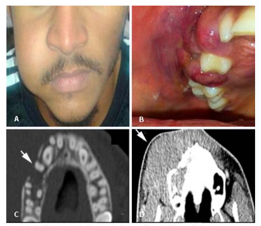
Fig. 1. (A) Extraoral view of the lesion. Evident facial asymmetry caused by a painful swelling in the right maxilla. (B) Intraoral view of the lesion. Presence of an ulcerated, multinodular tumor with a soft consistency and anteroposterior extension into the right maxilla involving the gingival mucosa and buccal vestibule causing mobility of the involved teeth. Differential axial.

A fine needle aspiration biopsy (FNAB) of the buccinator muscle region revealed that 90% of the cells (CD45++/+++) of the lymphoid B lineage (CD 19+++, CD22+/++ and CD20++/++) co-expressed Calla antigens (CD10++/+++) and lymphoid T cells (CD5+/-). The cells also presented clonality for the light-chain kappa +/++. CD3 and CD23 T lymphoid antigens were negative. FNAB data suggested the possibility of B cell lymphomas derived from the germinal center, known as BL. An incisional biopsy of the superior right gingival mucosa region was performed to confirm these findings. The subsequent histopathological analysis revealed mucosal fragments that were partially coated by well-differentiated squamous epithelial cells whose underlying tissue showed extensive infiltration of lymphoid lineage cells with moderately pleomorphic and hyperchromatic nuclei with little broad and optically clear cytoplasm in addition to the numerous macrophages that phagocytose cellular debris of apoptotic tumor cells, which created the standard morphological appearance of a "starry sky" (Fig. 2, A).